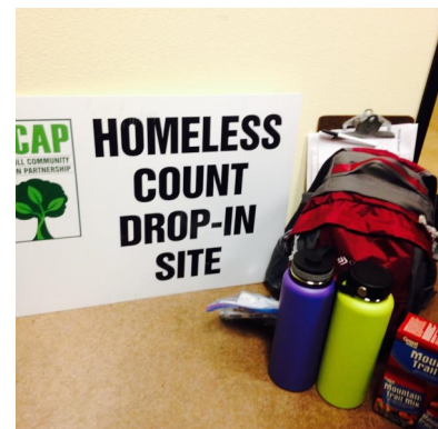
Staff record homeless families and individuals

Overall, 1,066 sheltered, unsheltered, and precariously housed persons were counted that night in Yamhill County. YCAP will continue to provide and implement programming that combats this unfortunate number. Thank you to all volunteers, donors, and staff who helped and made this important event possible. You can view a more in-depth review on our website, www.yamhillcap.org/homeless-count .